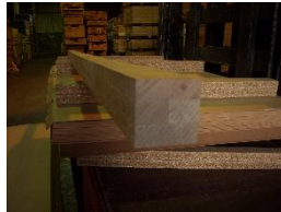
Lam Oak Handrails