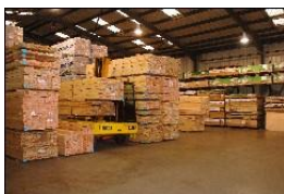
Red Pine Sawn