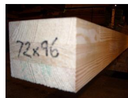
Red Pine