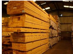
Red Pine Sawn