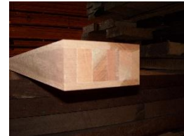
Lam DRM Door Stock