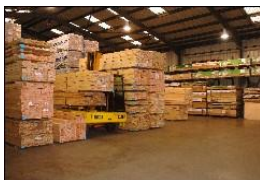
Red Pine Sawn