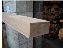
Lam Oak Door Stock