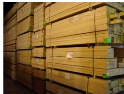
C/F Lam Red Pine