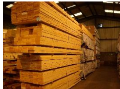
Red Pine Sawn