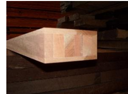
Lam Oak Stringers