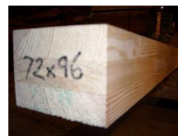
F/J Lam Red Pine