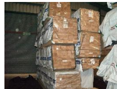
Red Pine Sawn