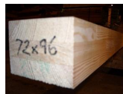
F/J Lam Red Pine