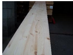
S/W Lam Red Pine