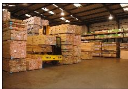
Red Pine Sawn