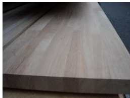
Lam Oak Stringers

275 x 32 Finger Jointed & Edge Glued Stringers x 4.8m