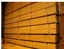
F/J Lam Red Pine

270 x 33 - 4.450m, 4.750m, 5.050m 270 x 33 Bullnosed – 3.000m